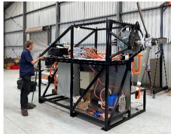
Through the AIR Pass program, AIR Hub experts assisted in the design, manufacture, and delivery of an EPS test rig for Dovetail Electric Aviation.

Partners to collaborate on autonomous systems development including Nova Systems for flight testing and Quickstep for composites manufacture.