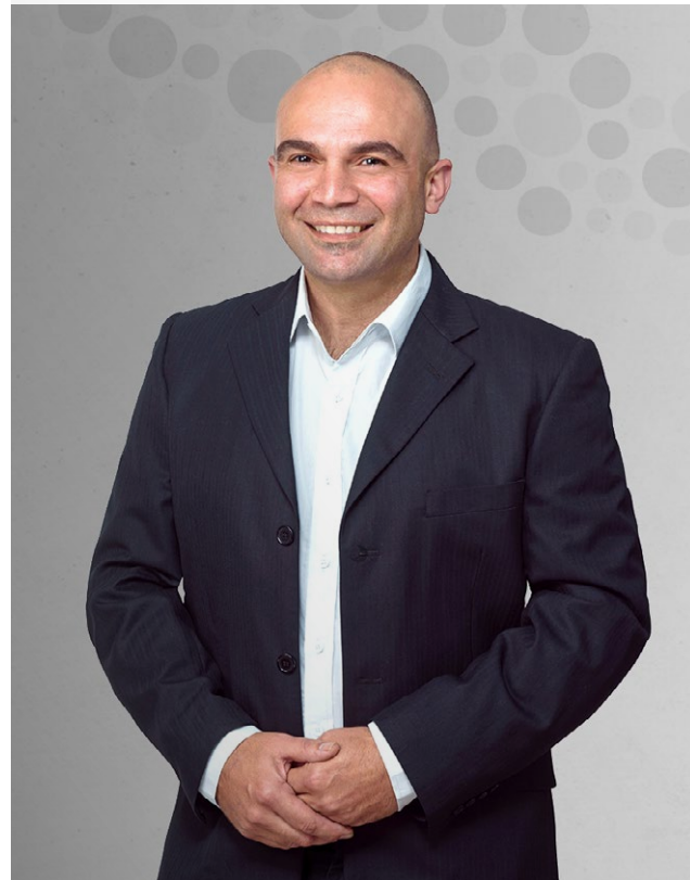
Proud Winner - Removalist of the Year 2018 Australian Furniture Removals Association